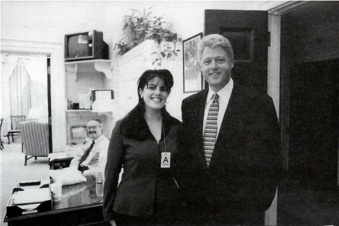
Monica Lewinsky and Bill Clinton outside the Oval Office in 1995.