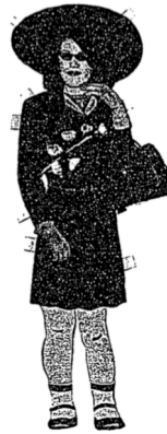
Questing for Fame