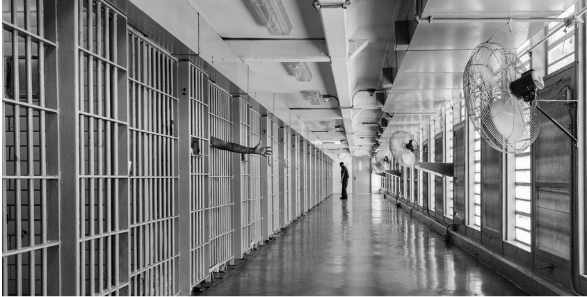
Figure 1. A row of cells at Angola Prison. 136