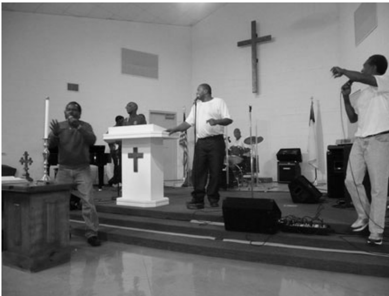
Figure 2. One of the chapels at Angola prison. 137

Figure 1 shows a series of cells, small in size with little to no potential for communication between inmates. In the photo, an inmate sticks their arm out of the cell,