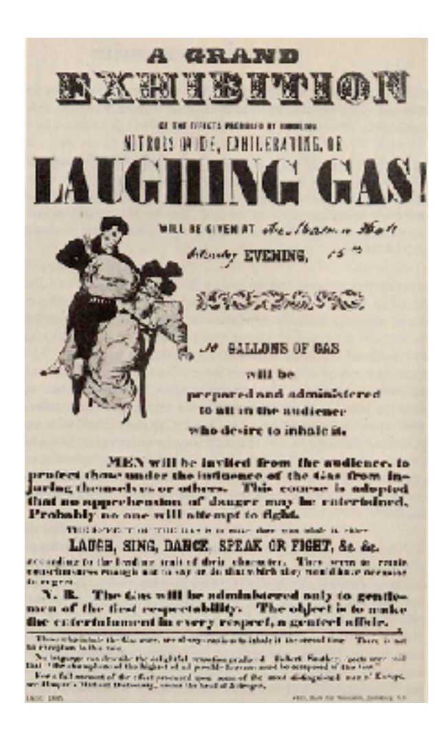
Fig. 1 Example of laughing gas as a party drug Pernick, Calculus of Suffering, 64.